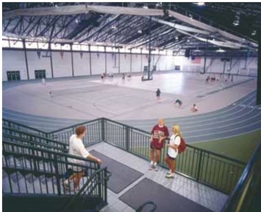
View of the Indoor Track from Second level of Shirk Center

A detailed schedule will be printed after all entries have been submitted