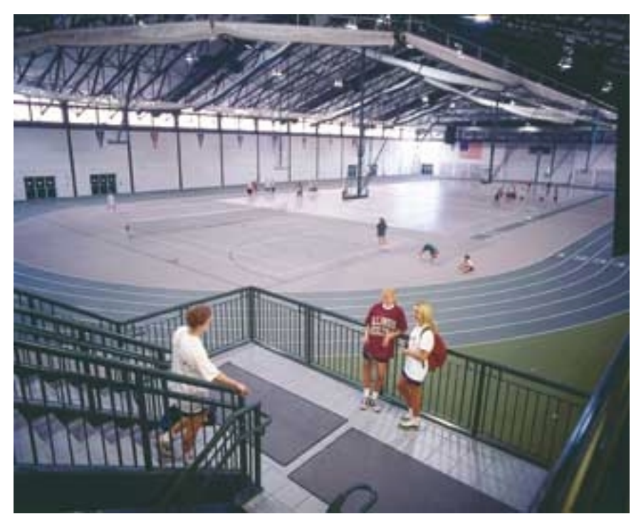
View of the Indoor Track from Second level of Shirk Center

A detailed schedule will be printed after all entries have been submitted